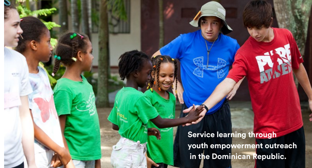
Service learning through youth empowerment outreach in the Dominican Republic.

How Gap Semester students continuously learn and grow over the course of their 12-week program.