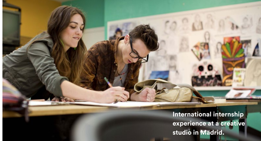
International internship experience at a creative studio in Madrid.

How Gap Year students continuously learn and grow over the course of their 25-week program.